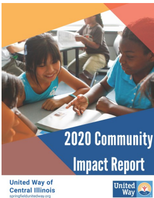
COMMUNITY IMPACT REPORT